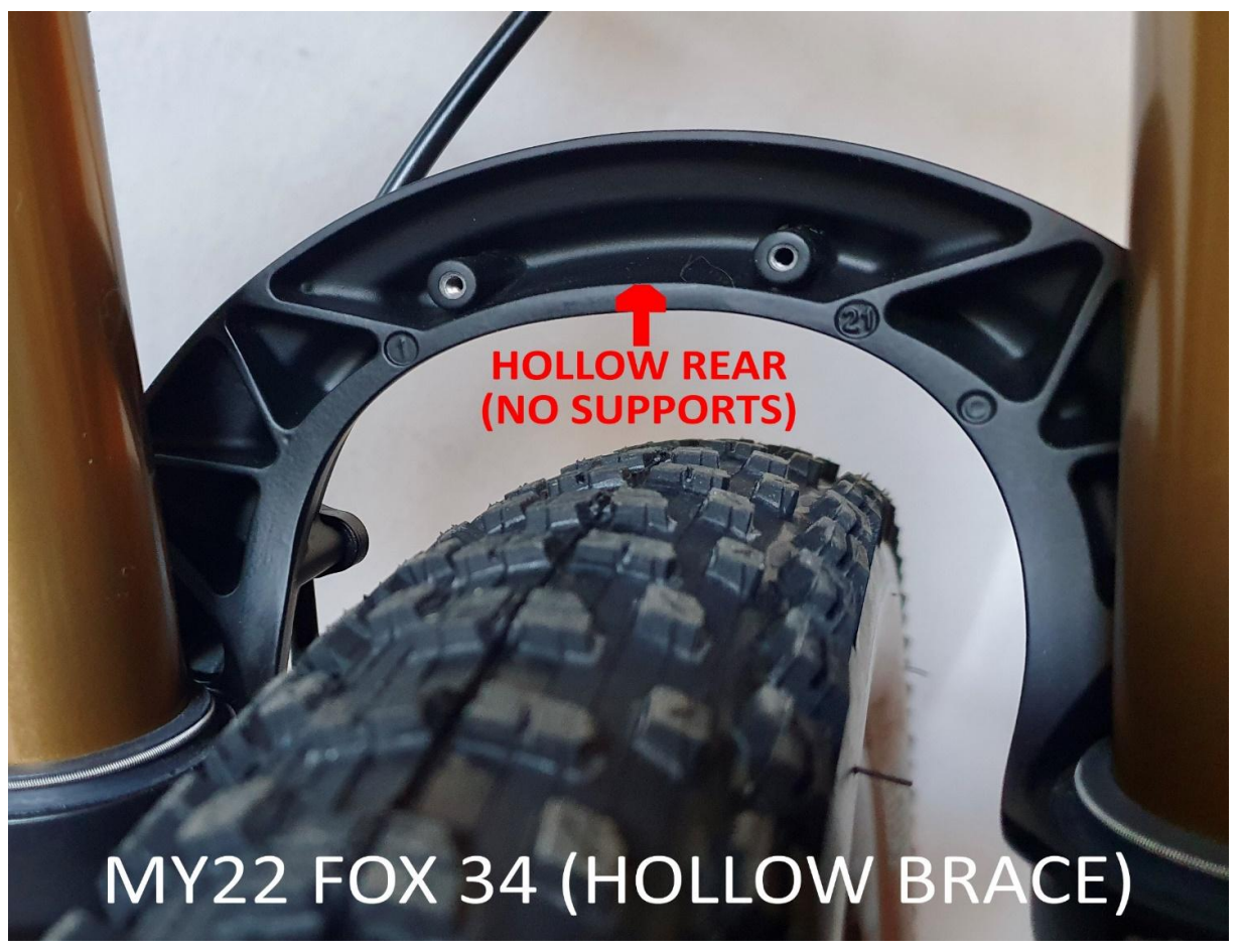
EXAMPLE - HOLLOW BRACE WITHOUT SUPPORTS: